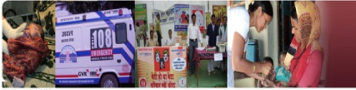
Home : NHM